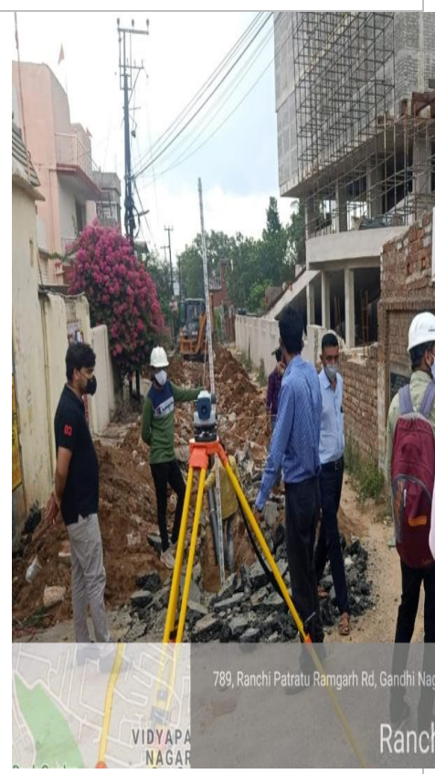
Photographs showing work in Laying of Pipe.